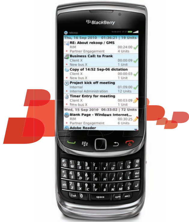
BlackBerry® Torch™ 9800 smartphone with a screenshot of the Rekoop application for BlackBerry®.