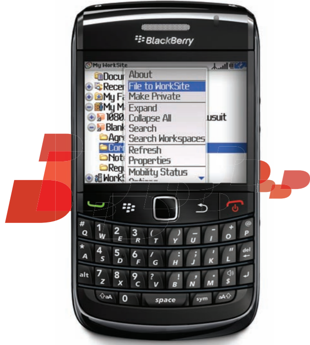
BlackBerry® Bold™ 9780 smartphone with a screenshot of the Autonomy iManage application for BlackBerry®.