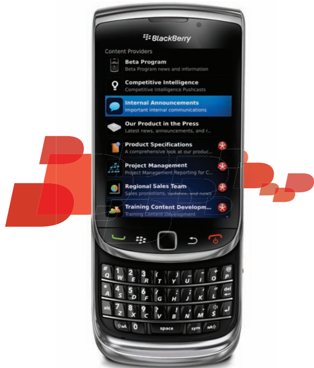
BlackBerry® Torch™ 9800 smartphone with a screenshot of the Chalk application for BlackBerry®.