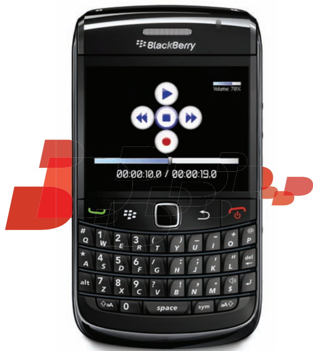
BlackBerry® Bold™ 9780 smartphone with a screenshot of the BigHand application for BlackBerry®.