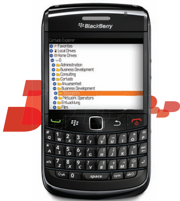
BlackBerry® Bold™ 9780 smartphone with a screenshot of the Cortado application for BlackBerry®.