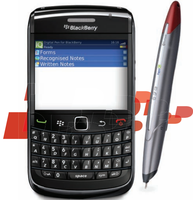
BlackBerry® Bold™ 9780 smartphone and Digital Pen from PaperIQ with a screenshot of the PaperIQ application for BlackBerry.